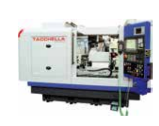
Universal Grinding Machines

External Grinding Machines CROSSFLEX A1100